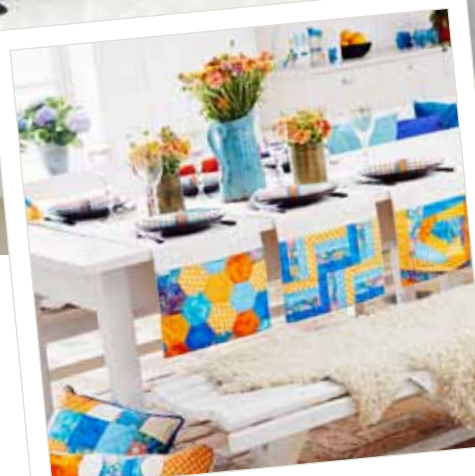
Amazing what we have done! Now, time to enjoy!

Welcome to the HUSQVARNA VIKING® family!