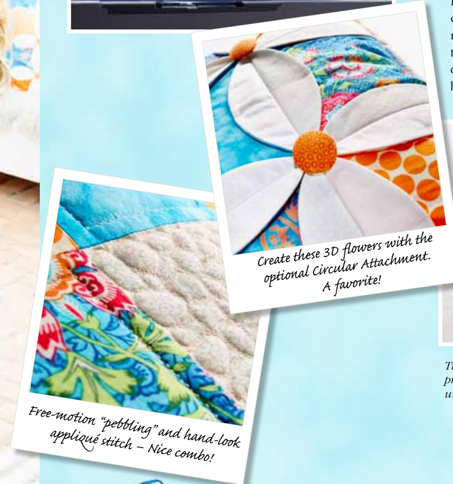
Create these 3D flowers with the optional Circular Attachment. A favorite!

Lining up and making buttonholes can be a big challenge, but not with a SAPPHIRE™ sewing machine! The Perfectly Balanced Buttonhole system sews both sides of the buttonhole in the same direction for balance perfection. There are several buttonhole styles to choose from.