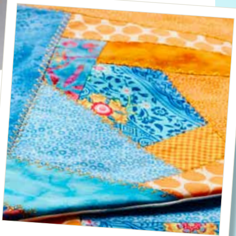
Hundreds of stitches to choose from!