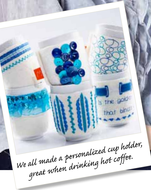
We all made a personalized cup holder, great when drinking hot coffee.

Choose from stitches up to 36mm wide when embellishing your projects