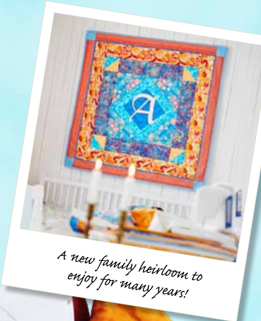
A new family heirloom to enjoy for many years!

Tip: Visit www.busquarnaviking.com to find tips & hints on how to make your own set of cup holders!