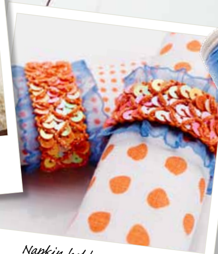
Napkin holders in no time! Sew decorative ribbons together – done!