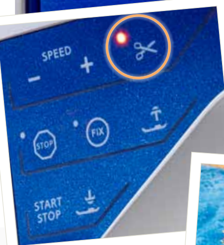
No need for scissors, just touch to cut the threads!